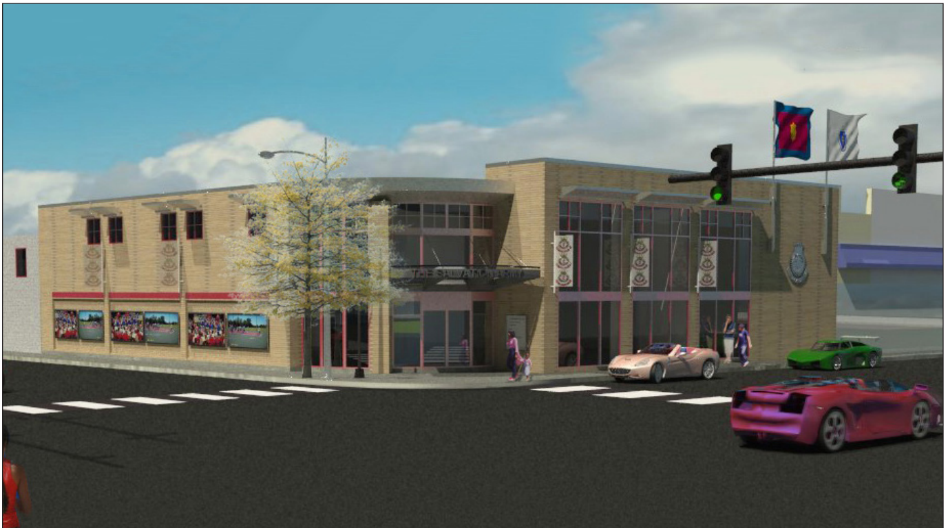
Proposed Concord/Howard Street Elevation Rendering