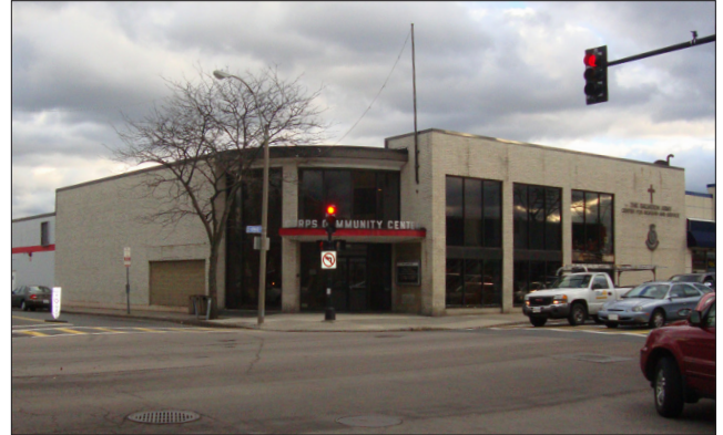
Existing Concord/ Howard Street Building Elevation

To address the clients renewed commitment to restore and repair the failing exterior masonry, APG submitted several exterior façade design and cost options. Proposed new second story punched window openings will allow light to penetrate into the gymnasium space and bring aesthetic balance to the elevations; a new curtain wall glazing system; metal sunscreens; wall mounted post and banners and several locations for digital advertising and community bulletins.