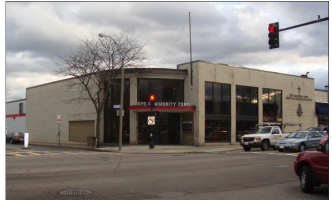
Existing Concord/ Howard Street Building Elevation

To address the clients renewed commitment to restore and repair the failing exterior masonry, APG submitted several exterior façade design and cost options. Proposed new second story punched window openings will allow light to penetrate into the gymnasium space and bring aesthetic balance to the elevations; a new curtain wall glazing system; metal sunscreens; wall mounted post and banners and several locations for digital advertising and community bulletins.